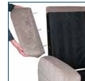
Removable Wings For Optimum Recyclability