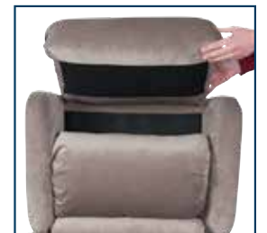
Fully Removable Headset