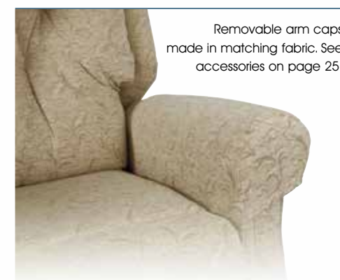
Removable arm caps made in matching fabric. See accessories on page 25.

Traditional elegant styling combined with timeless good looks allow the Regal to blend in effortlessly with most home environments.