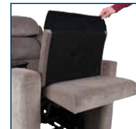
Fully Removable Duvet