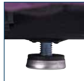
Height Adjustment System