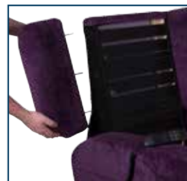
Removable Wings For Optimum Recyclability