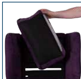
Adjustable Pillow Backrest (various styles available)