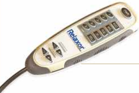
The Relaxor 5 motor massage controller. See accessories on page 25.