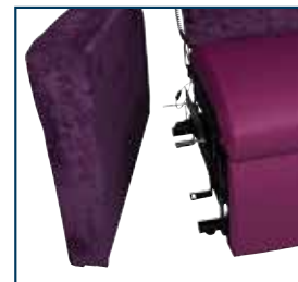
Integrated Width Adjustment System (patented design)