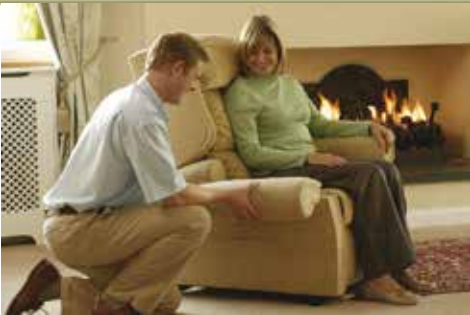
Optional removable, swing or lift up arms ensure side transfers are as quick and simple as possible. See accessories on page 25.