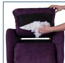
Adjustable Postural Support