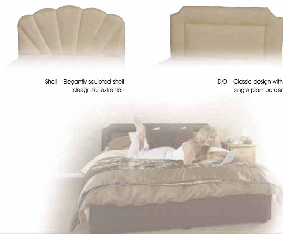
Shell – Elegantly sculpted shell design for extra flair D/D – Classic design with single plain border

Designed and handcrafted in the Rise & Recline Ltd. workshops, the luxuriously padded and beautifully detailed headboards are the ideal complement to the Cromwell, Richmond and Windsor beds.