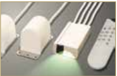
VRT massage Infrared remote handset containing both massage and bed controls. Night light is available as standard on both single and double zone systems.

The Blenheim exudes luxury and comfort, with a stylish and contemporary feel. Available in single, double and dual, the Blenheim features a fully padded and upholstered surround with integrated headboard for maximum comfort. This modern bed is upholstered in a vast range of fabrics as standard to complement any style of bedroom.