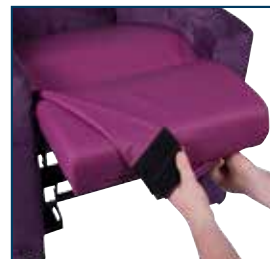
Fully Removable Duvet